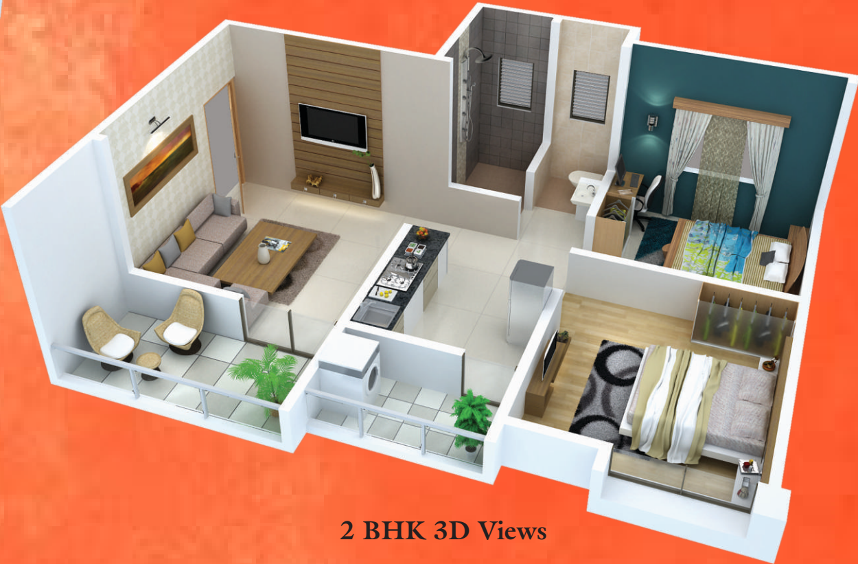
2 BHK 3D Views