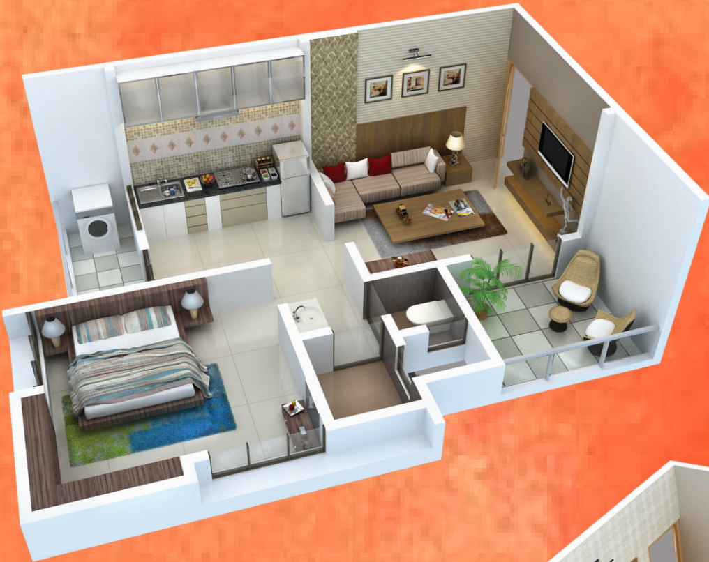
1 BHK 3D Views