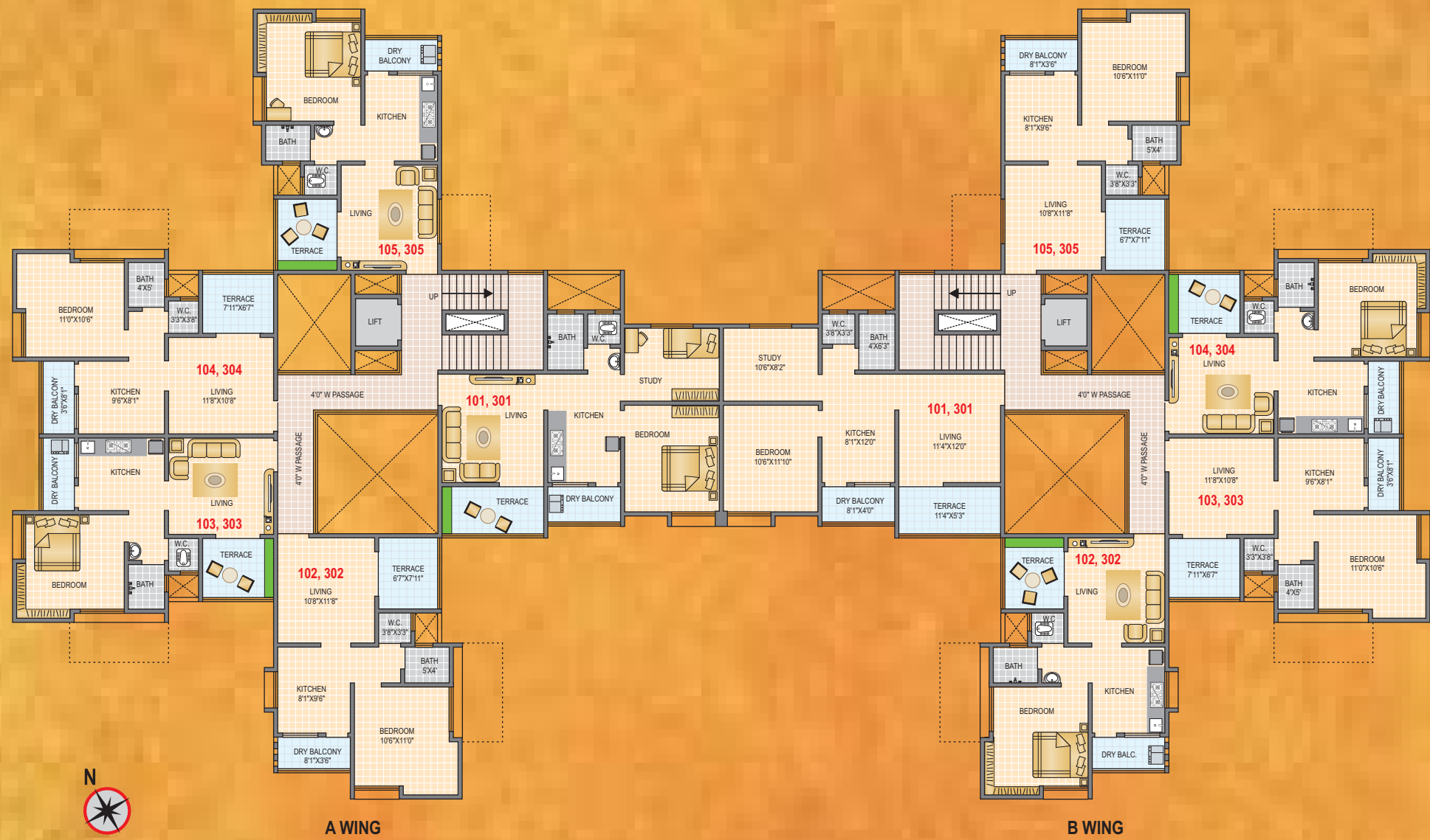
1st & 3rd Floor Plan